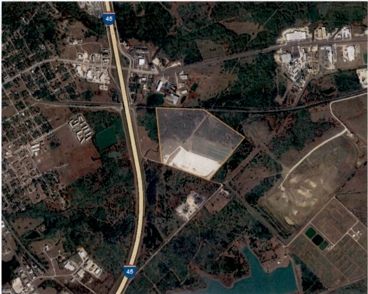
Exhibit "A" Overhead Map of Property